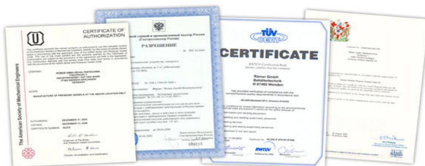
Range of certificates

We hold valid licenses to build pressure vessels according to: